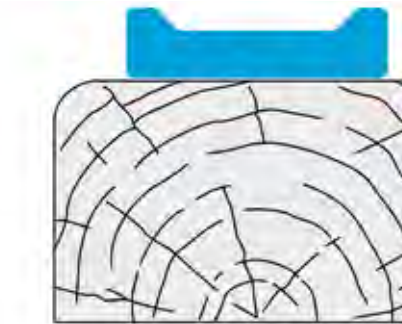
Fig. 2-16: Reynolds rail as a representative of the first flat rails, based on [27, p. 16]

of railways in England owed much to George Stephenson, a colliery worker from Northumberland, who studied and learned to repair stationary steam engines as a young man. By 1824 he had opened a factory to build steam locomotives for new colliery railways. This expansion of the early railways also saw the development of foundries and techniques to roll early wrought iron rails. The low level of friction in the contact of metal wheel on metal rail is the crucial advantage of the railway system, as less energy is required to transport large masses from A to B. [26]