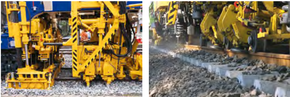
Fig. 5-26: Integrated consolidation unit (MATISA, left) and integrated DTS unit (Plasser & Theurer, right)

Network Rail has had considerable success in recent years with the use of the DTS on switch and crossing unit renewals. The particular machines used are the Unimat 09-4x4/4S Dynamic.