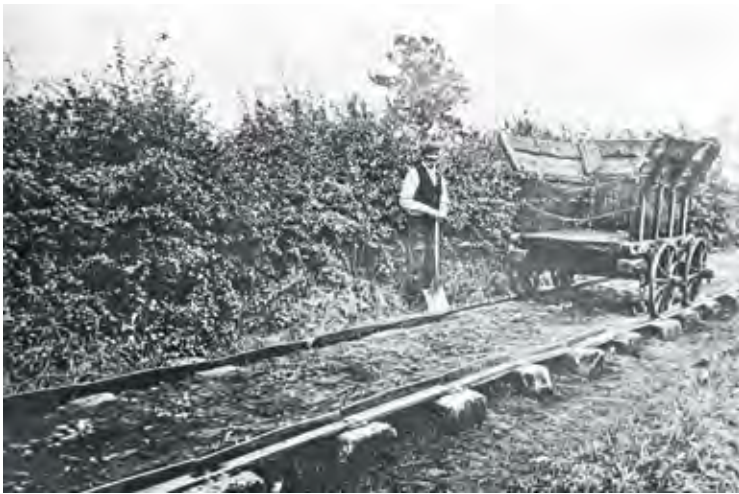
Fig. 2-17: Use of L shaped cast iron rails and stone blocks on the Denby Tramway-wagonway (Outram's Railroad) near Little Eaton, Derbyshire, England [28]