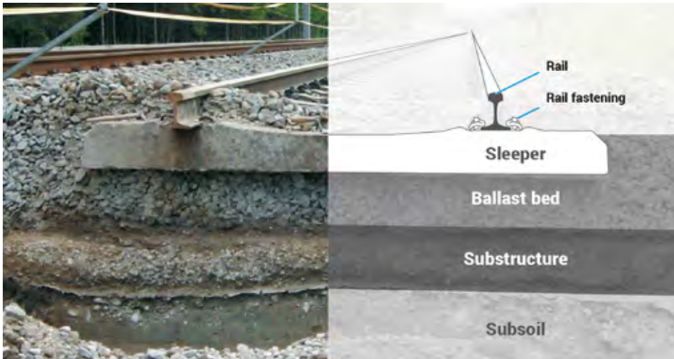
Fig. 2-15: Overview of the constituent elements of the permanent way

The track panel and the ballast bed underneath are part of the track system. The track panel consists of the rails, the fastening system and the sleepers, with no distinction being made between plain line and turnouts. Additional layers of sand, gravel or asphalt can be used underneath the ballast bed to improve the load bearing properties of the permanent way. In Austria and Germany, these layers are regarded as part of the track bed, while in Switzerland and the UK they are part of the substructure. Engineering structures such as bridges and tunnels as well as cuttings and drainage systems are also part of the substructure.