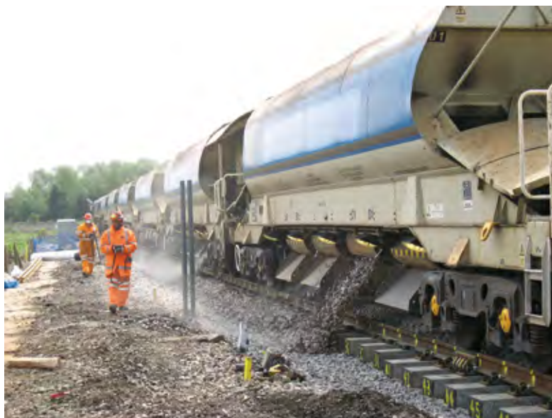
Fig. 5-27: Unloading new ballast in the UK [27]

On sections of line with high speeds, it may not be permitted to pre-deposit new ballast. Due to aerodynamic effects, high train speeds may cause a suction effect under the trains [28, p. 624] that can result in ballast being whirled up. This is known as flying ballast and can severely damage technical equipment of trains and endanger lives in station areas.