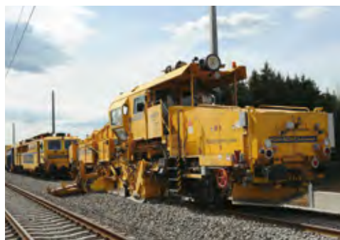
Fig. 5-28: Ballast distributing and profiling machines: R21 (MATISA, left) and USP2010SWS (Plasser & Theurer, right)