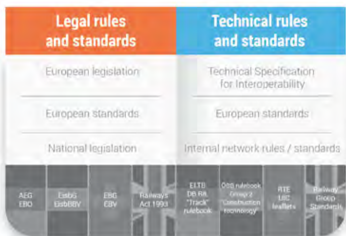
Fig. 1-1: Legal and technical rules and standards

The numerous acts of Parliament, laws, regulations, guidelines and work instructions of all kinds make it difficult to keep an overview. The following section will aim to provide the basic correlations between the legal and technical rules and standards in the four countries (Fig. 1-1). It will concentrate on the issues relating to the rail infrastructure.